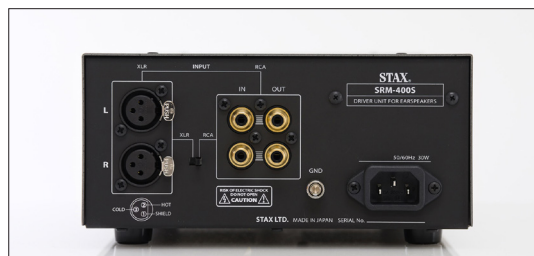
The RCA/XLR input and RCA PARALLEL OUT terminal are installed.