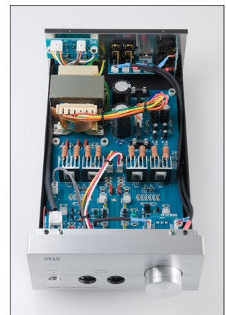
The enclosure is more rigid for better sound. The negative effects due to noise and vibrations are reduced.