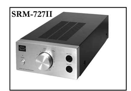
Solid state (NON-NFB) output stage

(All STAX Pro bias drivers are compatible)