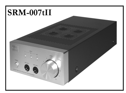
Vacuum tube output stage with 3 input selector